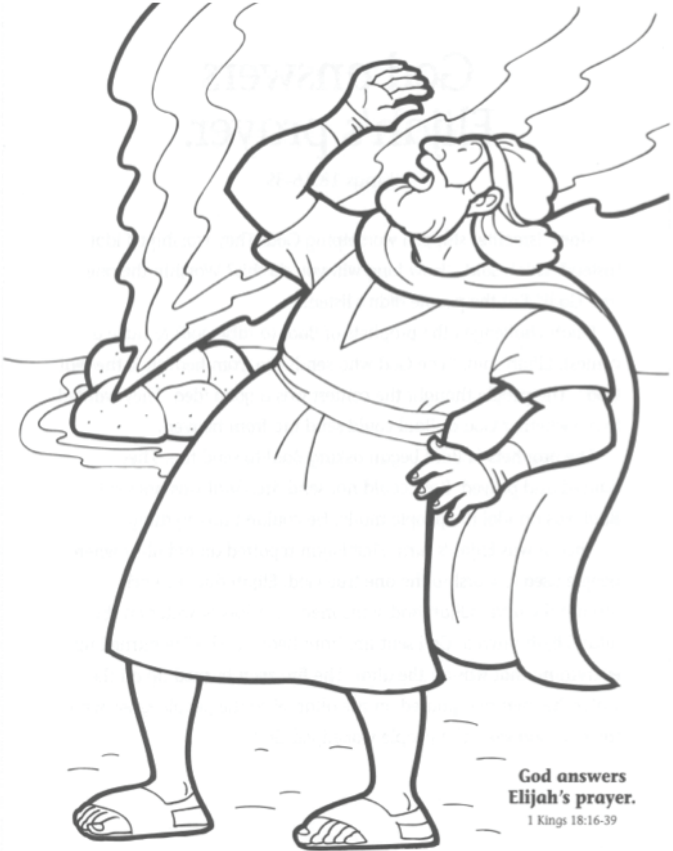
God answers Elijah's prayer. 1 Kings 18:16-39